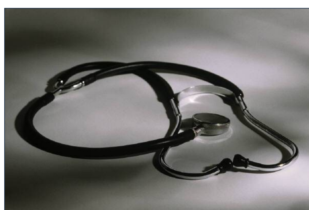
Figure 1. Label in 28pt Calibri.

We have more history with PowerPoint® than any other printing company. In fact, we helped Microsoft® design the software and we created all of the original color themes, templates, and clip art galleries. We know how to make your printed poster look just like it does on screen. Other printing companies and copy centers will blindly convert your file to another format prior to printing. This can result in text shifting, symbols changing, and altered colors. We know the secrets to avoid those issues. So choose Genigraphics for the most accurate reproduction available.