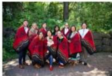
WY'EAST INAUGURAL COHORT