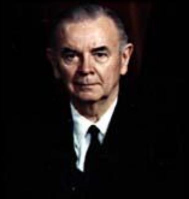
Brennan (Courtesy of the U.S. Supreme Court)