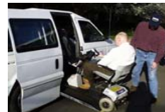
Our Service provides ADA Accessible Transportation

To apply for Paratransit or Dial-a-Ride service, get an application from the bus driver, or contact the NEOtransit offices in Baker City or LaGrande.