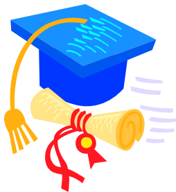
Kevin Hawke Portland, Oregon 2009 FSA Graduate

Over 140 fire professionals have completed an Eastern Oregon University FSA degree since 1981. Here is one of our graduates: